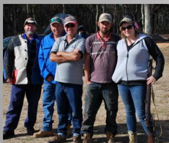
Competitors relaxing at the mound