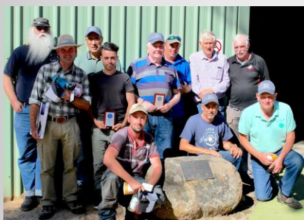
Some of the winners from the events